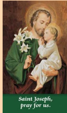
Saint Joseph, pray for us.