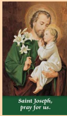
Saint Joseph, pray for us.