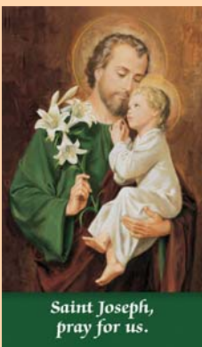
Saint Joseph, pray for us.